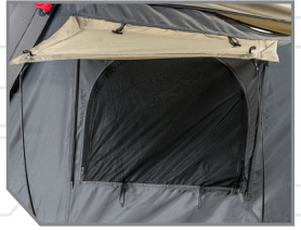
HEAVY-DUTY TENT RODS

Introducing the HD Bundu Hard Shell Cantilever Roof Top Tent by Overland Vehicle Systems, a groundbreaking addition to off-road adventures. Boasting a high-impact UV-stable ABS shell for unrivaled durability, the cantilever design simplifies setup from travel mode to a cozy retreat within minutes. Crafted from premium 280G Rip Stop material, the tent features ample storage pouches and large windows with 120G mesh for ventilation and panoramic views. Inside, a high-density foam mattress ensures a restful night's sleep. The aluminum honeycomb base enhances durability and keeps the tent lightweight, with straightforward setup and closure. Choose from 2-4 person configurations, promising comfort, convenience, and unwavering quality for an elevated camping experience.