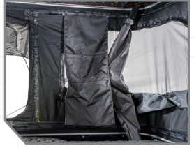
INTERNAL STORAGE OPTIONS