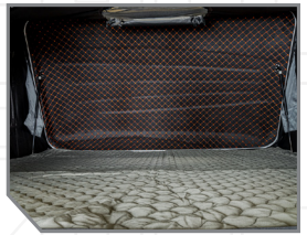
HIGH DENSITY FOAM MATTRESS